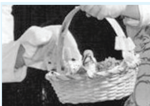
Tarettes used to give away baby ducks to the "lucky" little kid that found the golden egg!

Unfortunately, our annual Kids Easter Party has been cancelled this year.