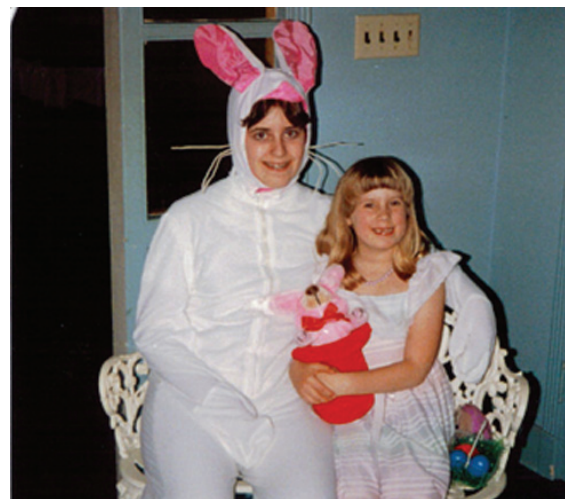
My grandmother made these costumes and I believe she also made a few extras.