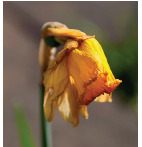
Bad bug wilts TYC Daffodil Festival