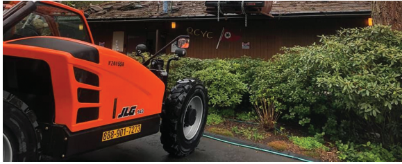
Outstation roof replacement underway