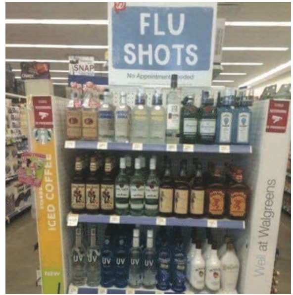
New alternative Kung Flu shot