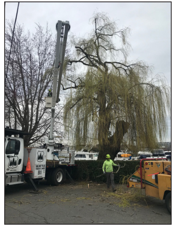
QCYC willow tree gets a trim