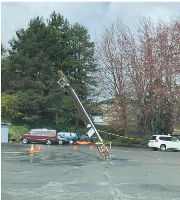
Garbage truck trashes mainstation light pole!