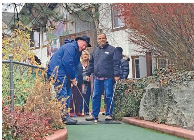
Fleet Captains' 'Land Cruise to Leavenworth Open' mini-golf outing