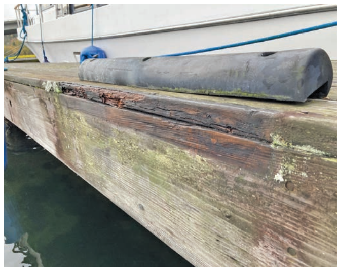
Why club leadership instituted Rule 2.08