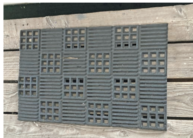
Breathable welcome mats welcome