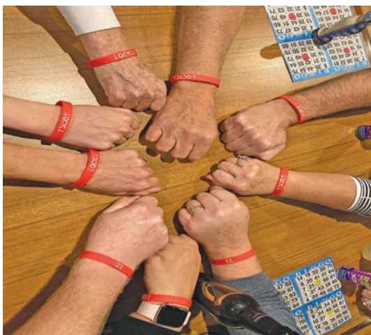
Proof of vaccination bracelets now popular accessory