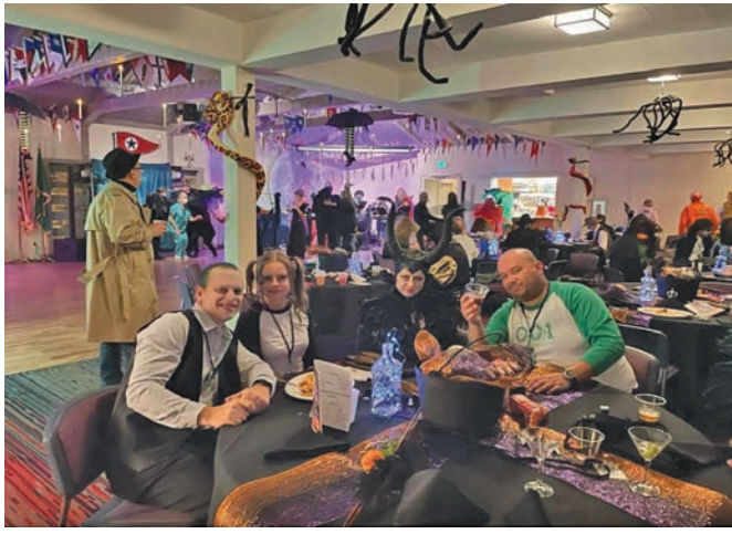
A great time was had by all at the Halloween Party