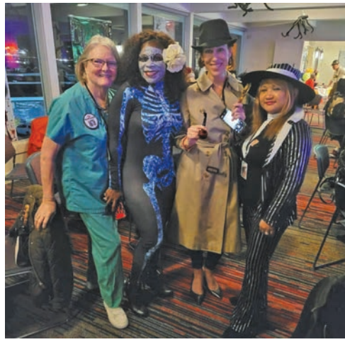
Commodore & friends dressed for the party