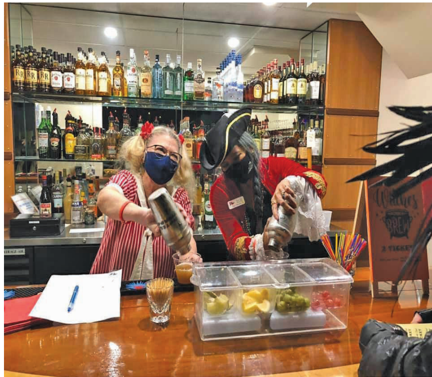
Thanks to bartenders