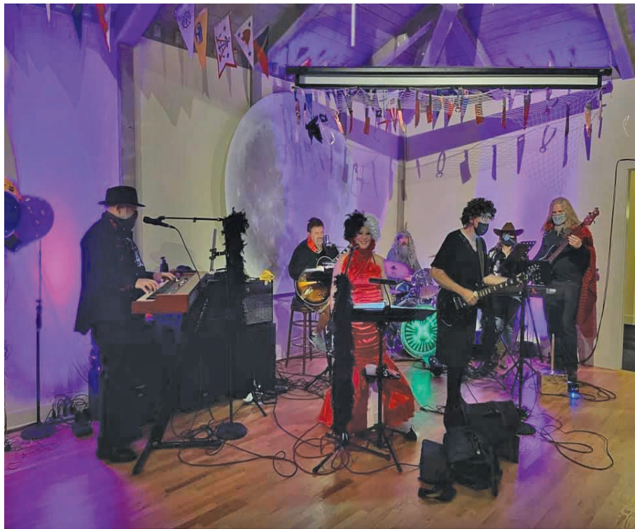
Three Sheets blues house band rocked