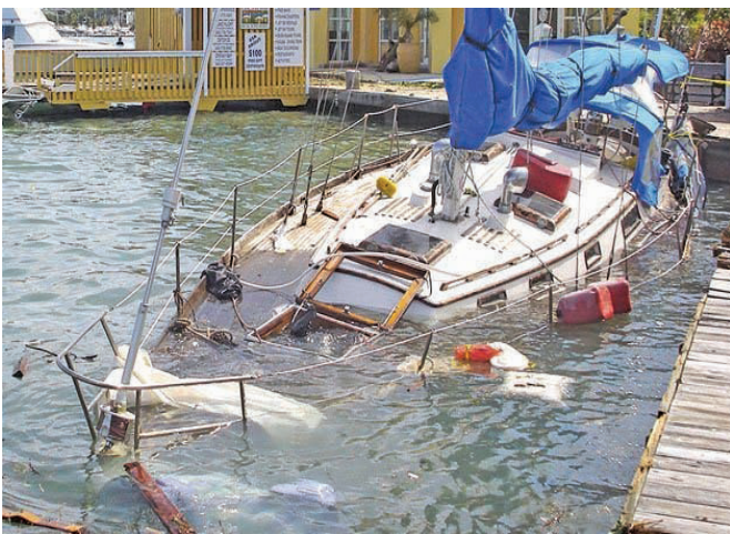
Mooring members must provide emergency contact info