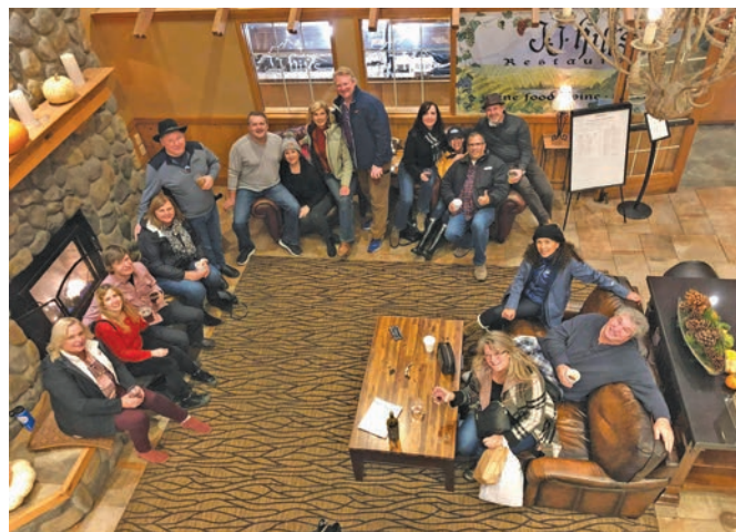
Fleet Captains' land cruisers enjoyed Leavenworth

Make reservations today for the Captains' Christmas Dinner, 12/9; Chet Gibson Memorial Cruise & Electric Christmas Ball, Potluck & Dance Party, 12/11; New Year's Eve Black & White Vaccination Ball, 12/31