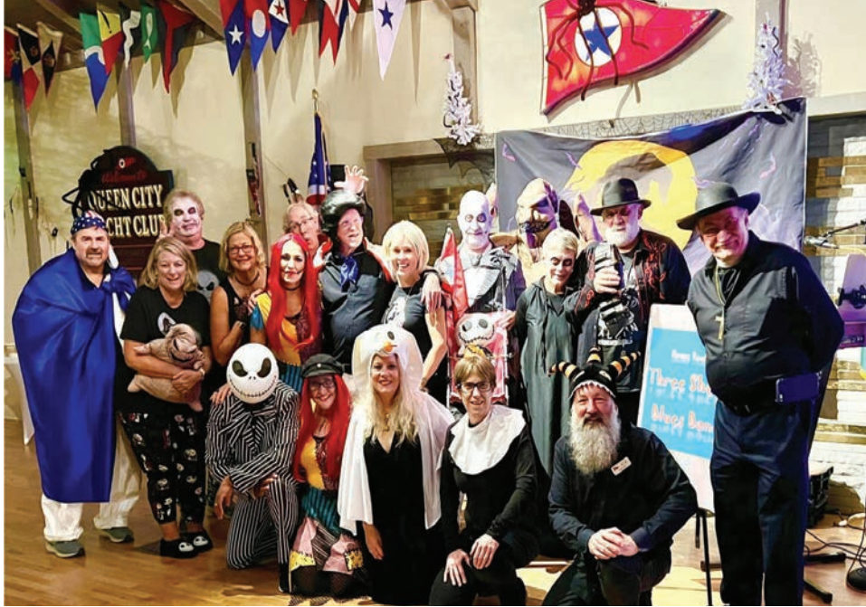
Nightmare before Christmas Crew