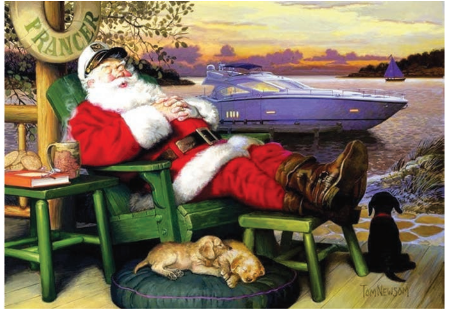
Santa at rest