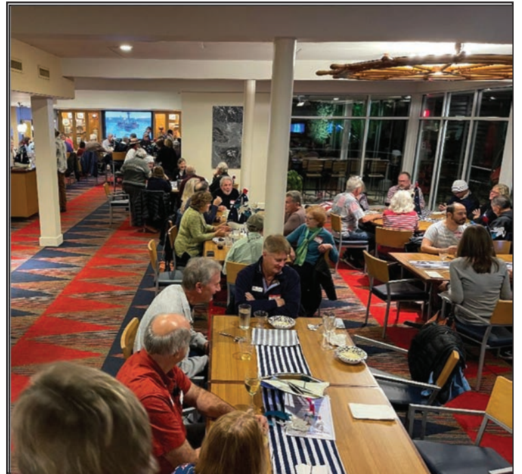
More than 80 Members Attended the Sailor Social Stew & Brew