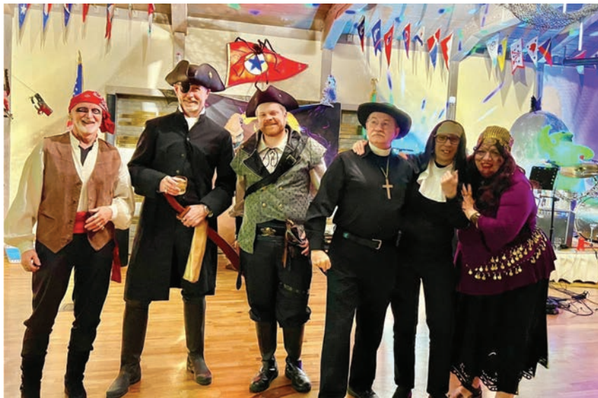
Halloween Party was fun for everyone