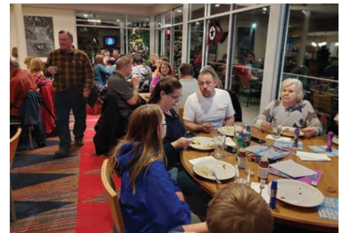
Bingo players packed second deck

followed by lively rounds of Bingo. Thanks to the generosity of QCYC Members, more than $1000 was raised to help homeless students at Lowell School.