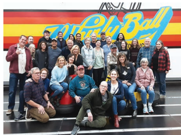
Fleet Captains Whirlyball land cruisers

Wishing all Members and their families a safe and joyous holiday season!