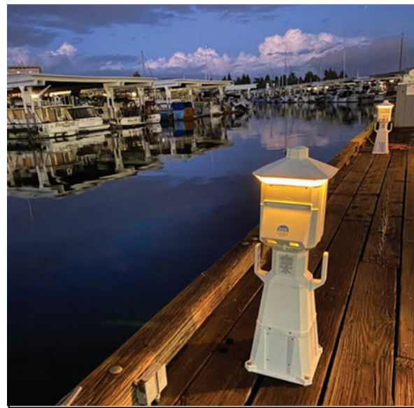
New shore power pedestals at the Mainstation

Besides Ground Fault electrical safety, two bonus objectives were also accomplished. We were able to move the pedestals one foot further away from the edge of the dock to reduce the risk of vessels hitting them when docking. And the new sensor-controlled LED lights on the pedestals not only look great they provide light inside the pedestal so you can see the outlets to insert your plug and they illuminate the dock