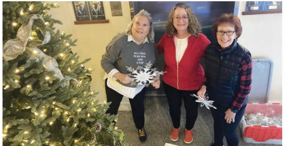
Thanks to Member Elves

Thanks to your many volunteer elves for holiday decorations at the Mainstation! Second deck trees have a new design this year. Don't miss seeing our new Children's Snowman tree and Nutcracker/Kitchen tree. Queen City is very fortunate to have such talented and creative members!