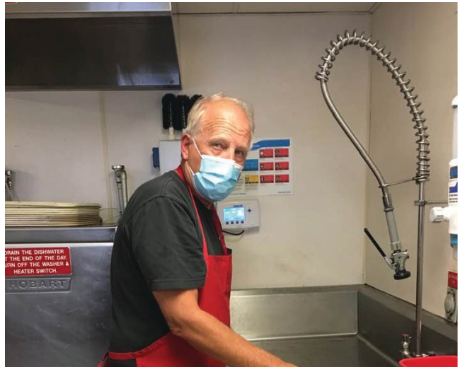
Several volunteers worked the dishwasher all weekend