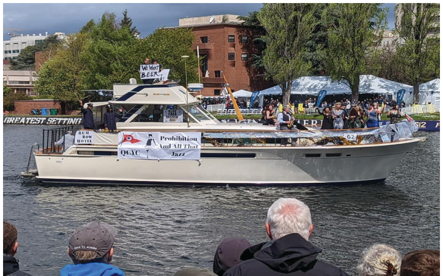
QCYC Opening Day decorated boat present the Rum Row Motel & all that jazz aboard Blue Crab