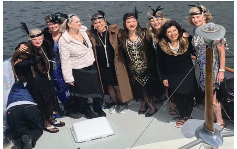
Thanks to ragtime dance troupe for helping QCYC win in our decorated boat category