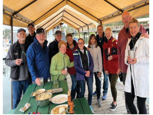
QCYC crew enjoy happy hour at the Deer Harbor outstation

By the time you read this, Memorial Day weekend will have happened. Then July 4th weekend and Labor Day will be the next big weekends. These events are always well attended and worth participating in if you haven't before. Safe boating!