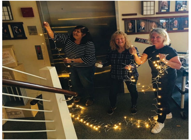
Members light up the mainstation for Opening Day