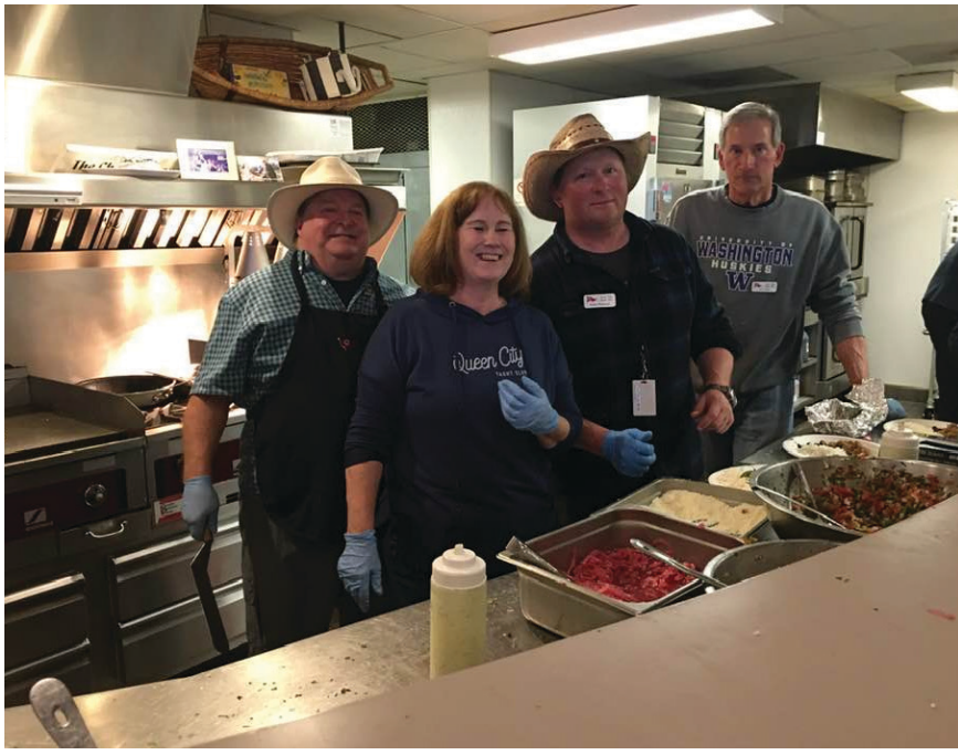
Street Taco Thursday crew in the galley