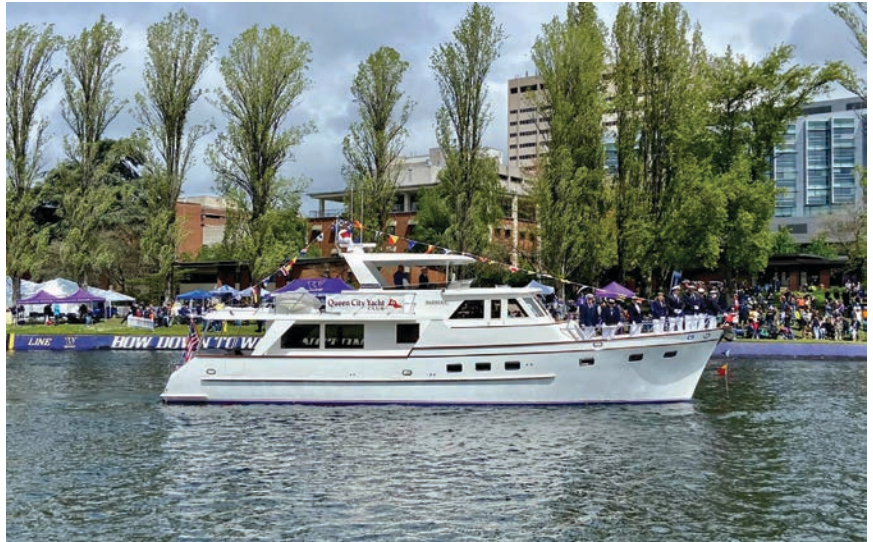
Bridge Officers present our colors on Opening Day