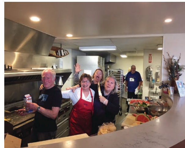
Galley crew rocked the galley for Tarettes Sunday morning breakfast

I bid you all farewell and wish you a wonderful summer of boating!