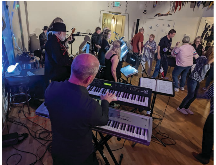
House bands got great reviews and blew visitors away