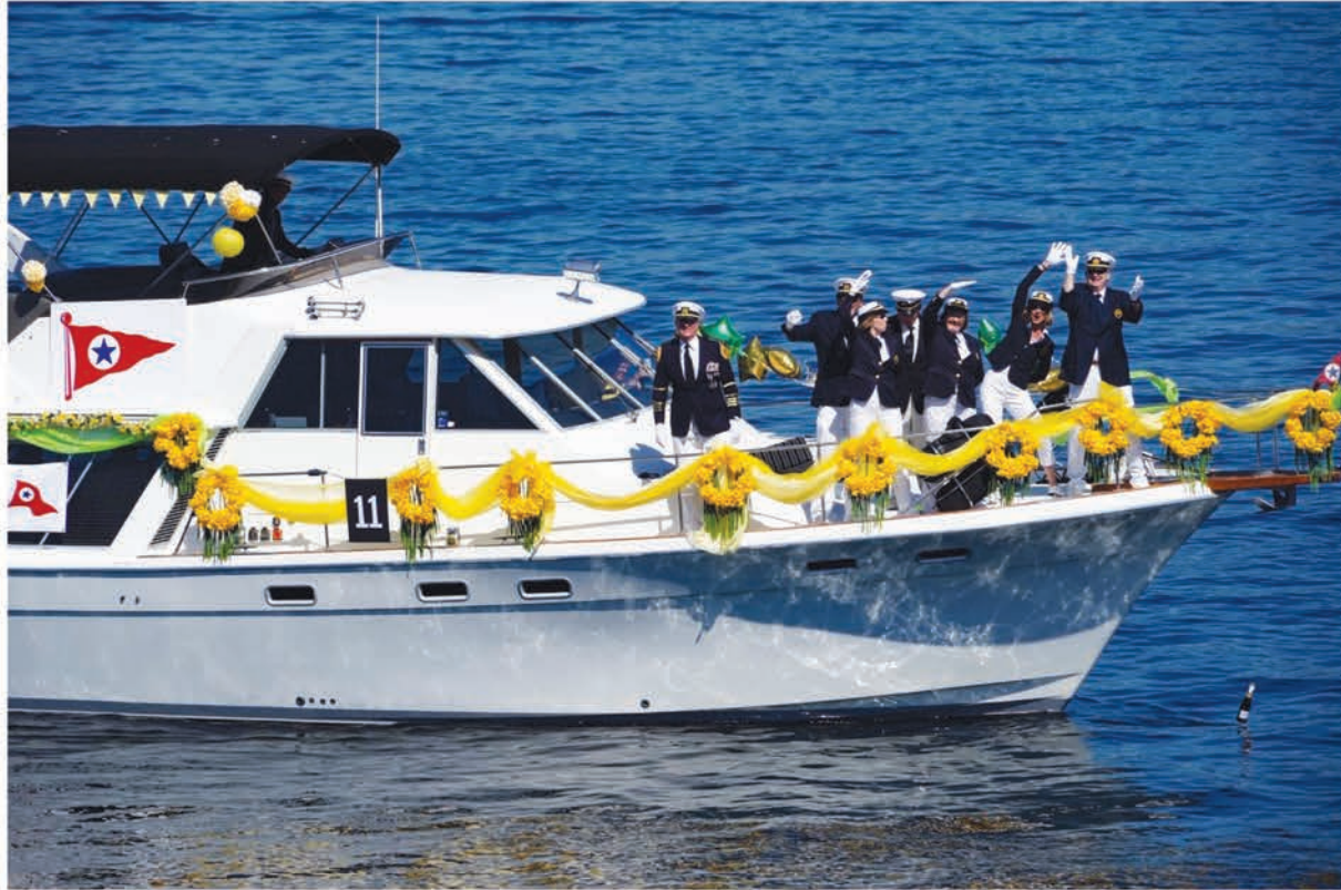
QCYC bridge rides the ROSE for TYC Daffodil Marine Festival