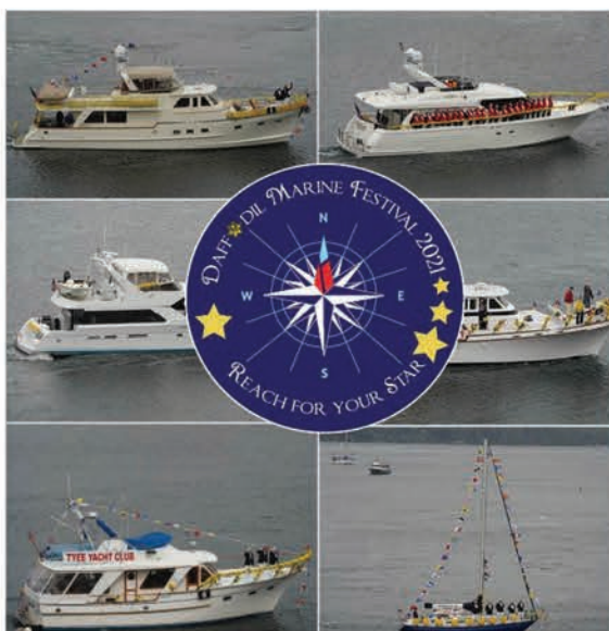
Daffodil Marine Festival 2021

Remember to hang a white cloth of some sort on the bow of your boat if you are willing to have a member boat raft to you at