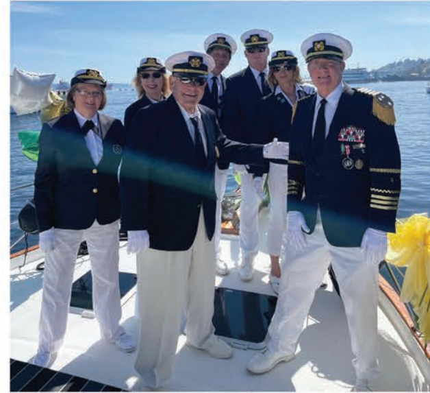
QCYC Bridge Blooms at TYC Daffodil Marine Festival