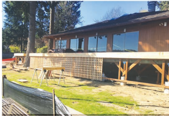
New deck taking shape