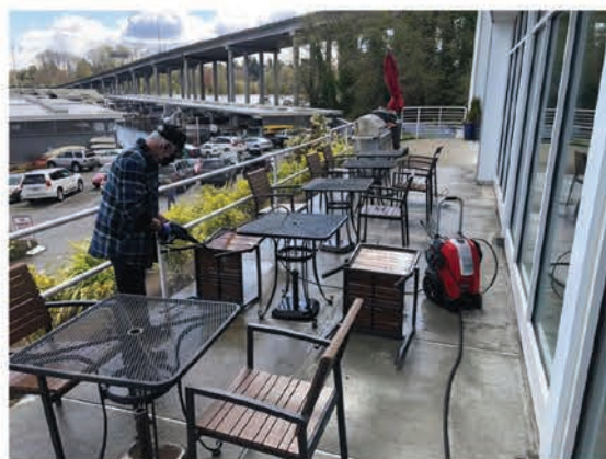
Deck furniture gets a good wash