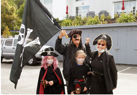
DeLaunay priates rounded out the Closing Day Festivities