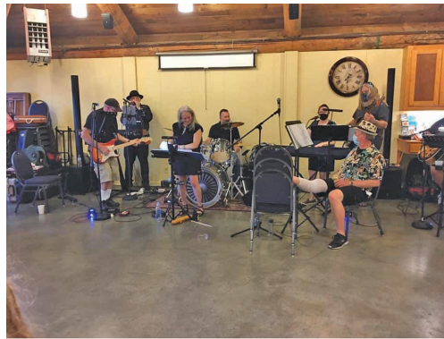
'Three Sheets to the Wind' blues band rocked the outstation