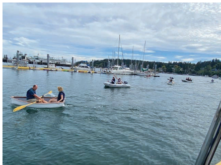
Don't Spill the Wine Dinghy Relay Race