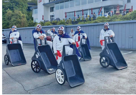
Return of the QCYC 'Dock Cart Drill Team'