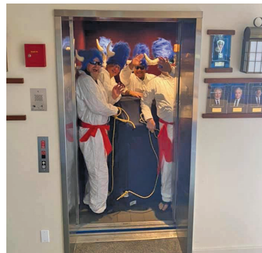
Wranglers run the bar upstairs for Closing Day