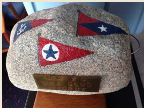
This rock reminds Queen City members of a history of fine predicted log racing.