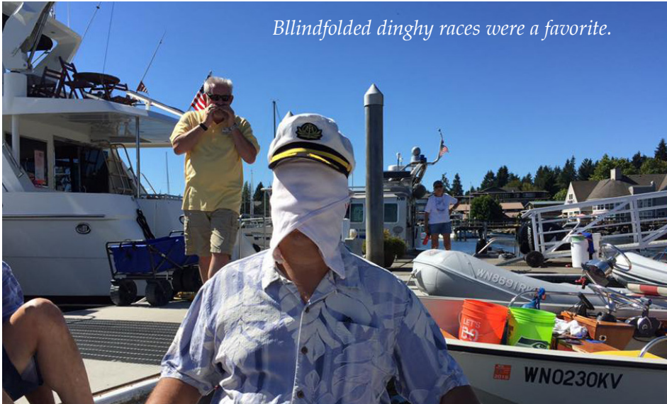
Blindfolded dinghy races were a favorite.