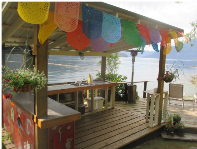
Boater's kitchen includes a wood fired pizza oven.

side trail. A sign promises, "water and stuff". In addition to the visual indications, we could hear the gurgling tones of rushing water- apparently just out of sight and