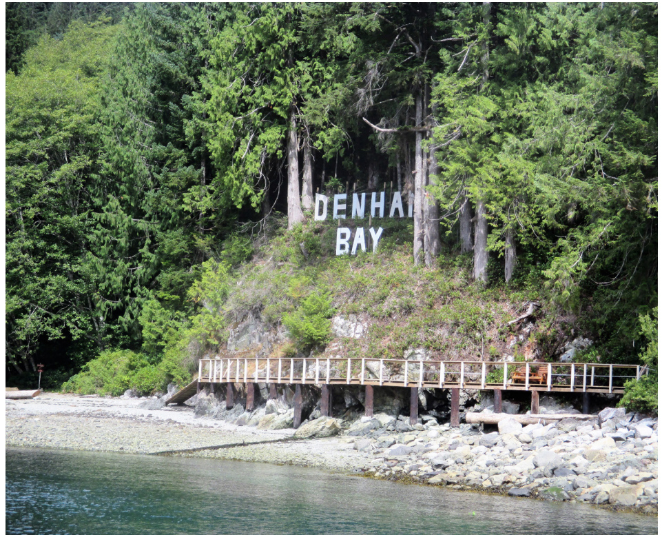
Beach boardwalk at Denham Bay

deck with a good book and/or a favorite beverage. Scenery here is beyond stunning. Greens so dark they run to black define