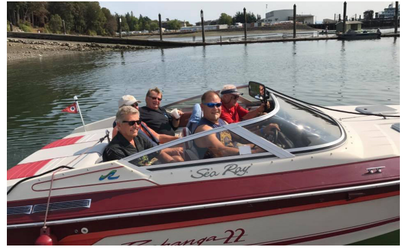
Runners aside, this is not a photo of the metal band Mötley Crüe