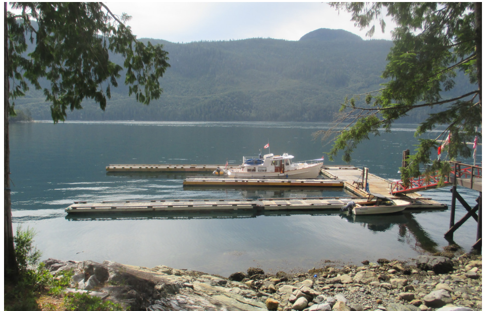
Docks are not crowded in August

My spouse is dedicated to walking at least 10,000 steps per day. We accomplished most of that at Denham Bay with a brisk walk on some trails and a logging road. Our path began at the far end of the beach to the left of the resort. The footpath merged with a logging road, now seldom used and covered with short grasses. We reached a junction, with a directional side indicating that a waterfall was 10-minutes up the hill to the right. The steady climb was no more than moderately strenuous for a couple in our middle sixties. On an August afternoon, the air was shirt sleeve pleasant- certainly not