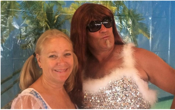
Mary Anne and the Movie Star