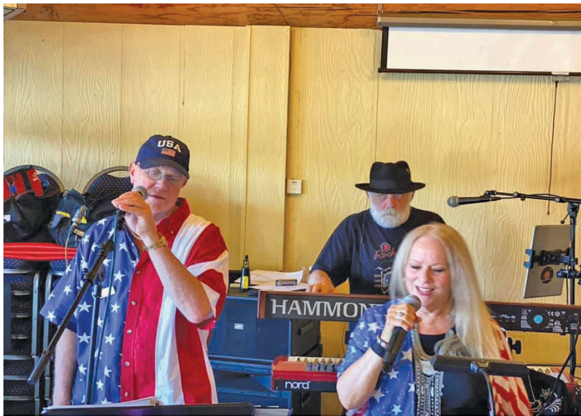
House band Red, White & Blues on July 4th

Great fun at the 4th of July weekend at the outstation with dinghy parades...more than one, Gourmet Breakfast Buffet, Five-star BBQs, Corn Hole Championship games, S'mores at the Fire Pit, and lively live music thanks to the QCYC Music Committee's 3 Sheets Blues Band & Desolation Sounds.