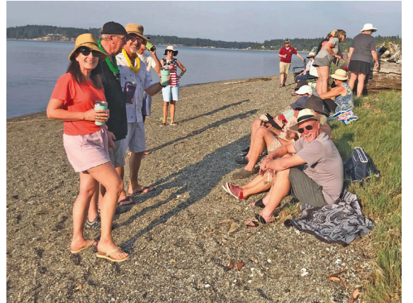
Beach party at Stretch Island