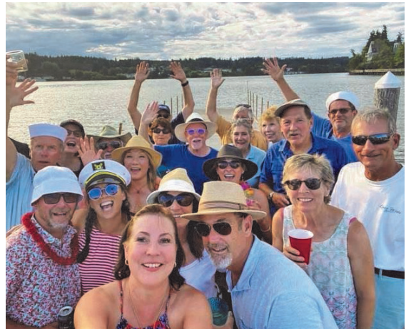
Fleet cruisers press on & rock the dock at Poulso