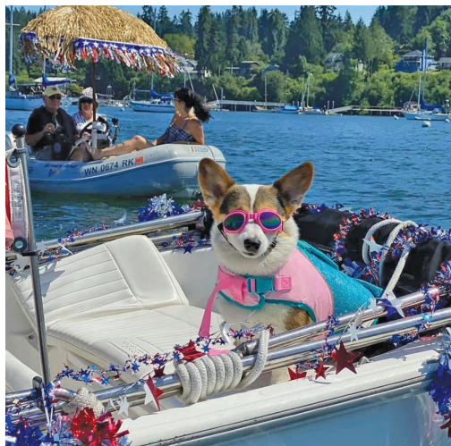
Guard dog oversees July 4th dinghy parade