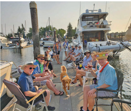
Fleet Captain's cruise to Swantown