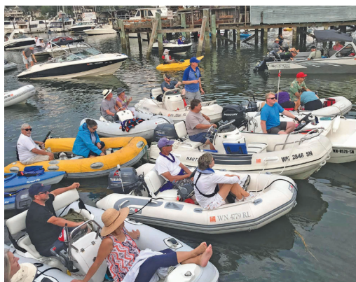
Summer fleet cruisers dinghy-in to Gig Harbor